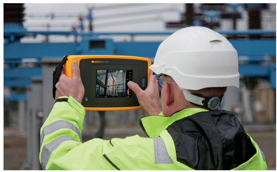
Image taken of the ii910 Precision Acoustic Imager detecting partial discharge in a high voltage application.