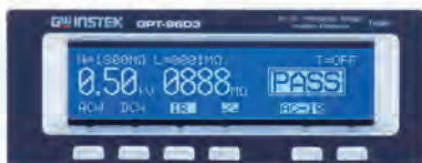
Large LCD, High Intensity Indicators and Function Keys

The 240 x 48 display clearly shows the applied voltage, test parameters, test conditions, measurement value and result on the screen at the same time. The real-time status update on the LCD display accompanied by the multi-colored LED status indicators on the front panel allow operators to have a full control of the test process to perform precision test and avoid unnecessary operation risks at the same time. The status indicator above the high voltage output terminal will automatically flash when an output is in place. In addition, the function keys arranged below the LCD display provide convenient operation that test functions can be easily changed by a single pressing.