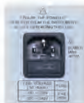
Universal Input Voltage Range

Additionally, the GPT-9600 series provides the universal input voltage range for operating equipment in countries with different electrical power standards. With the GPT-9600 series, the hustle of switching or selecting input voltage range can be left behind. Furthermore, 50Hz or 60Hz can be selected to provide a stable and appropriate test voltage without relying on the electrical environment conditions of input power so as to meet the test requirements.