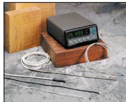
The thermistor version of the "Tweener" gives you more variety in sensor configurations and even higher accuracy over a limited temperature range.

Each Tweener and its accompanying probe (sold separately) have their own individual calibration reports. Overall system error can be calculated from the individual errors, rendering the added cost of system data unnecessary. However, for those requiring it, system data is available at two or more temperatures of your choice. (See calibration options on page 156.)