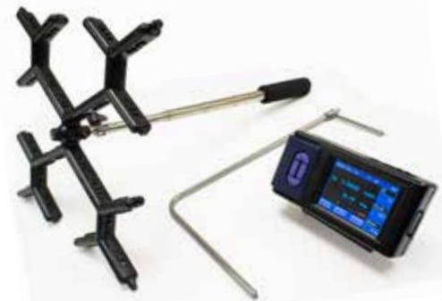
Pitot tubes and Velocity-Grid are available from Kanomax