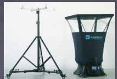
Portable stand: extends up to 6.9' from top to base