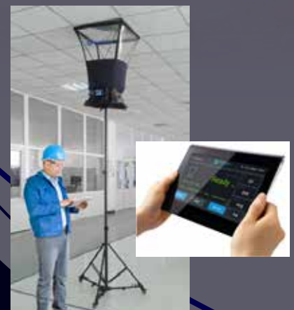
The Bluetooth® feature can send data to any Android-based device