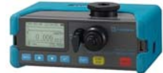
With Rubber Protector