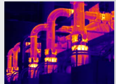
MultiSharp Focus, available on the Ti450 PRO