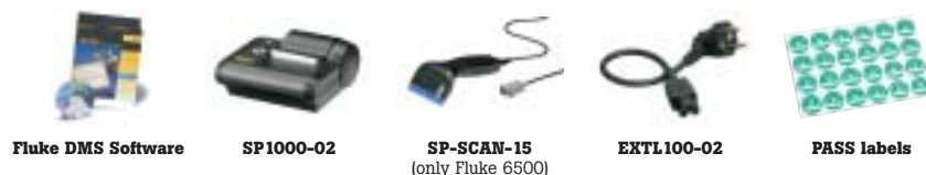
Fluke DMS Software