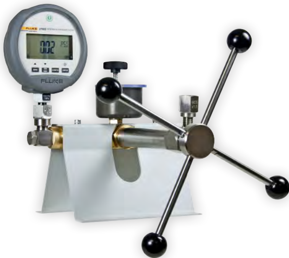
Combine the 2700G gauge with the P5510, P5513, P5514 (shown here) or P5515 Comparison Test Pumps for a complete bench top pressure calibration solution.

The 2700G Reference Pressure Gauges provide best-in-class measurement performance in a rugged, easy-to-use, economical package. Improved measurement accuracy allows it to be used for a wide variety of applications. It is ideal for calibrating pressure measurement devices such as pressure gauges, transmitters, transducers, and switches. In addition, it can be used as a check standard or to provide process measurements with data logging.