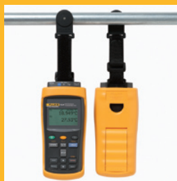
TPAK Magnetic Hanger