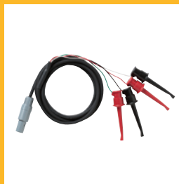
Universal RTD Adapter