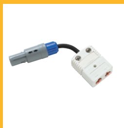
Universal Thermocouple Adapter