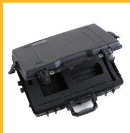
Probe and Readout Case