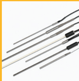
Calibrated Temperature Sensors

A wide array of accessories is available to help you maximize productivity, but the following are essential for most users.